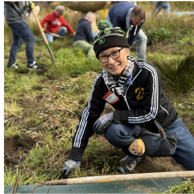
Gay for Good San Francisco volunteer helping pull weeds at our beautification project at the San Francisco Zoo