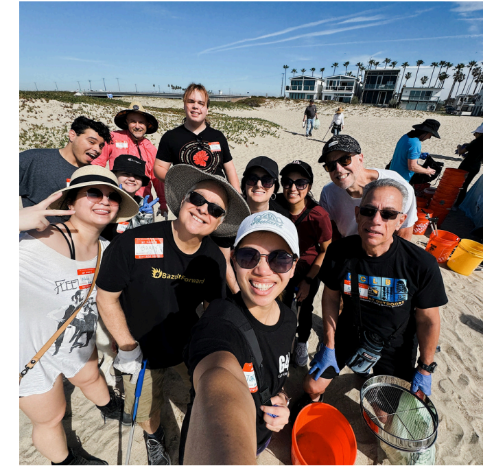
Gay for Good OC/Long Beach Chapter volunteers at our beach cleanup with Coastal Corridor Alliance