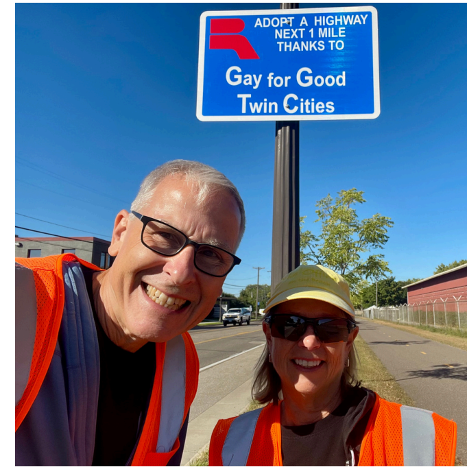
Gay for Good Twin Cities volunteers keeping our adopted highway section clean