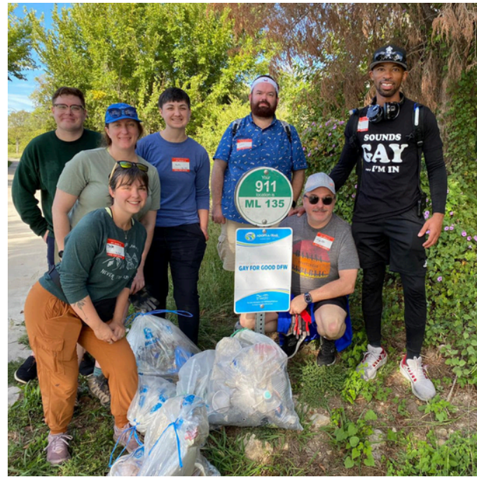
Gay for Good Dallas-Fort Worth volunteers with multiple bags of trash and debris they cleaned at our adopted trail section