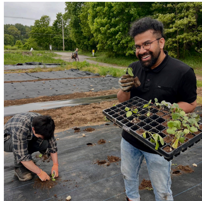
Pictured Right: Gay for Good Boston volunteers planting vegetables at Nubia Farms.