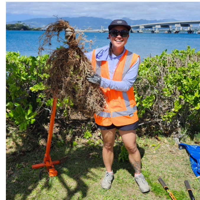
Pictured Left: Gay for Good Oahu volunteer removing invasive plants from the Pearl Harbor Arizona Memorial Park.